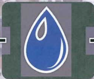
H 2 FLOW HARD WATER TREATMENT