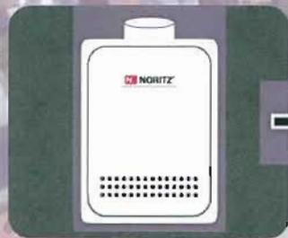
NORITZ TANKLESS WATER HEATER